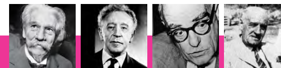
A. Schweitzer T. Wilder A. Rubinstein J. Ortega y Gasset

The bicentennial celebration of the birth of Wolfgang Goethe in 1949 provided an excuse to bring together a group of prominent intellectuals from all over the world in Aspen, Colorado, searching for a way out of the profound crisis which affected the West following the two World Wars. Among others, this group included Albert Schweitzer, Thornton Wilder, Arthur Rubinstein, and José Ortega y Gasset.